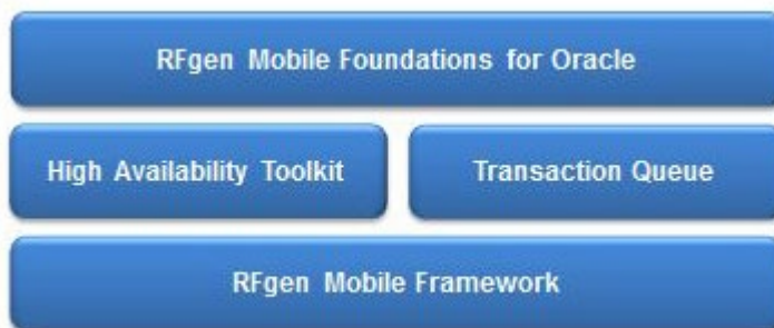
Figure 3: The RFgen remote warehouse technology stack.

At the heart of RFgen's Mobile Framework is the RFgen Transaction Queue. This transaction queue is a robust and intelligent queuing mechanism that records and queues the local activity. When the enterprise is available, it intelligently submits the transactions. Another important component is RFgen's Mobile Foundations for Oracle E-Business Suite. This certified open-source suite provides a very effective yet lightly-coupled architecture enabling this approach. Finally, the RFgen High-Availability Toolkit comes pre-packaged with a set of pre-tested database scripts used to build the required database artifacts.