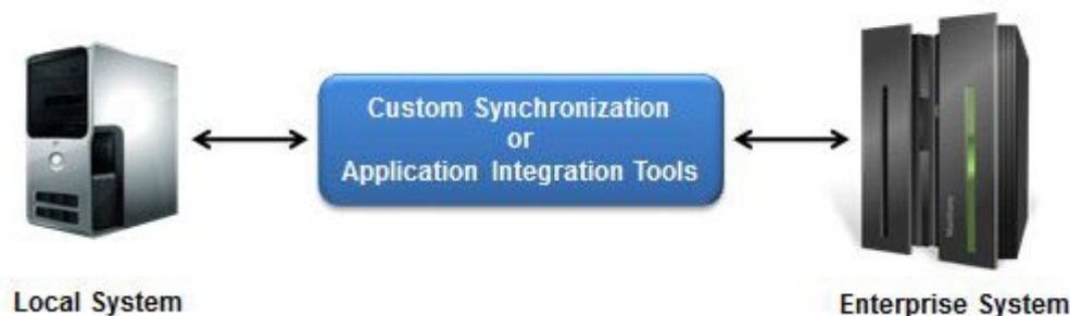
Figure 1: Many manufacturers are moving to a distributed warehouse model which is making it more challenging for IT to manage.

The traditional approach is to maintain a separate warehouse system. This provides uptime to the local facility but at a significant cost. Traditionally, IT managers design and build custom data synchronization routines to shuttle data back and forth from the local system to the enterprise system. This method addresses the short term problem but leaves the organization with a system that has an increasing number of points for failure and a lower ability to react to change and new IT initiatives. Most of the time organizations must employ full-time resources to make sure the synchronization routines are running properly and the data is flowing smoothly.